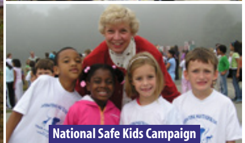
National Safe Kids Campaign